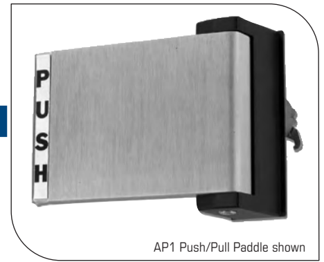
AP1 Push/Pull Paddle shown

For use with ADL deadlatch and other brands of narrow stile mortise deadlatch. Paddle is four-way reversible. Select application required by referring to chart below. Handing can be reversed on cam plug by removing C- clip and flipping the cam over and reinstalling C- clip.