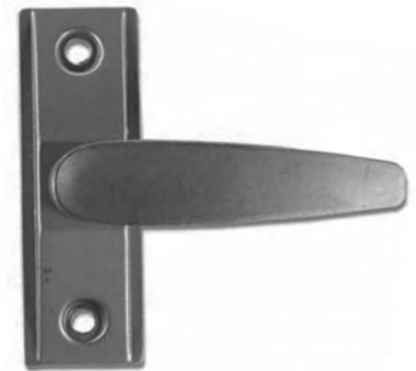
AL1 Lever Handle shown